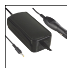
978361000 Car cigar lighter adapter