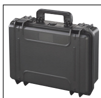
978852000 Transportation hardcase

Optional accessories: Car cigar lighter P/N 978361000 Transportation hardcase P/N 978852000 A/V cable P/N 978852000