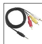
978853000 Audio/video cable

(*): the display of digital encrypted programs is possible, if user has a valid subscription card and if the encryption type is supported by the TV Meter. Please check with our sales department when ordering. Dolby is a trade mark of Dolby Laboratories.