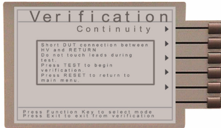
Figure 2: VERI-CHEK Self Verification Screen

It is a good practice to regularly review your product safety testing workstations and the skill levels of your operators. Reviewing these guidelines in a regular interval will help to limit potential shock hazards. Newer test instruments that include new technology can also make testing safer. These things together with properly training and educating your operators are the best means to prevent the risk of injury. We hold free ½ day seminars throughout the year. These seminars can help manufacturers to provide their personnel with proper training and education. Please contact Associated Research if we can be of any assistance at 1-800-858-8378 or email us at info@asresearch.com . You can also obtain additional information on safe testing methods from our web site at www.asresearch.com .