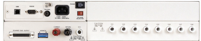
Model SC6540 HNM* 8 Channel High Voltage Scanner