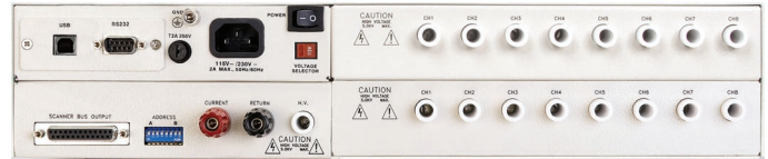
Model SC6540 HHM* 16 Channel High Voltage Scanner