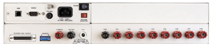
Model SC6540 GNM* 8 Channel High Current Scanner