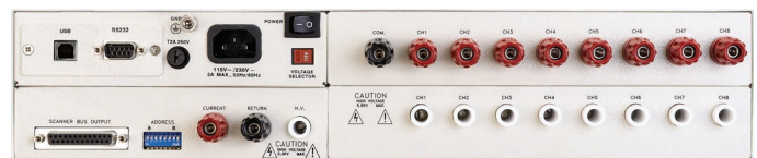
Model SC6540 HGM* 8 Channel High Voltage Scanner 8 Channel High Current Scanner