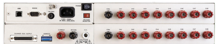
Model SC6540 GGM* 16 Channel High Current Scanner

Specifications subject to change without notice.