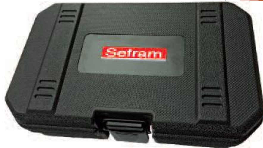
Rigid transport case (option)