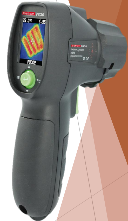
Sefram 9830 - Thermal camera