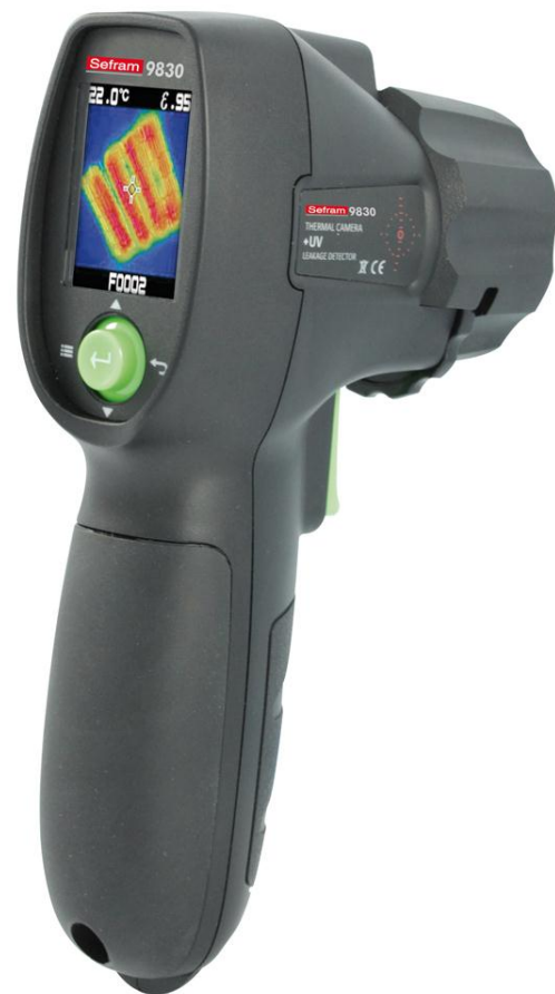
Sefram 9830 - Thermal camera