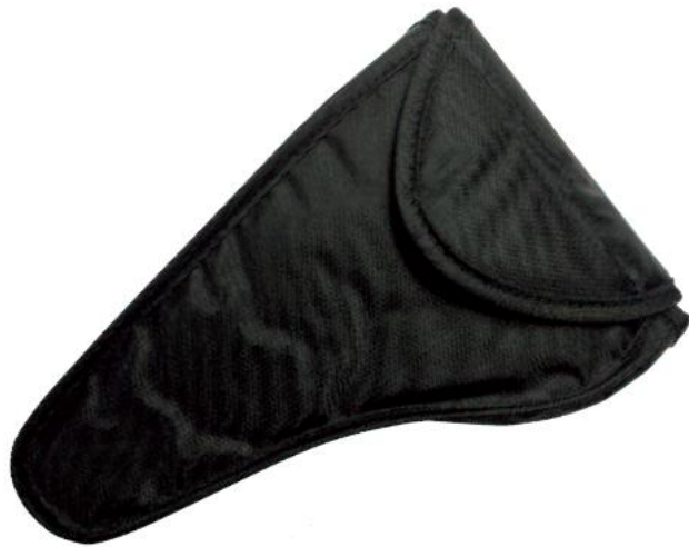
Soft carrying pouch (option)