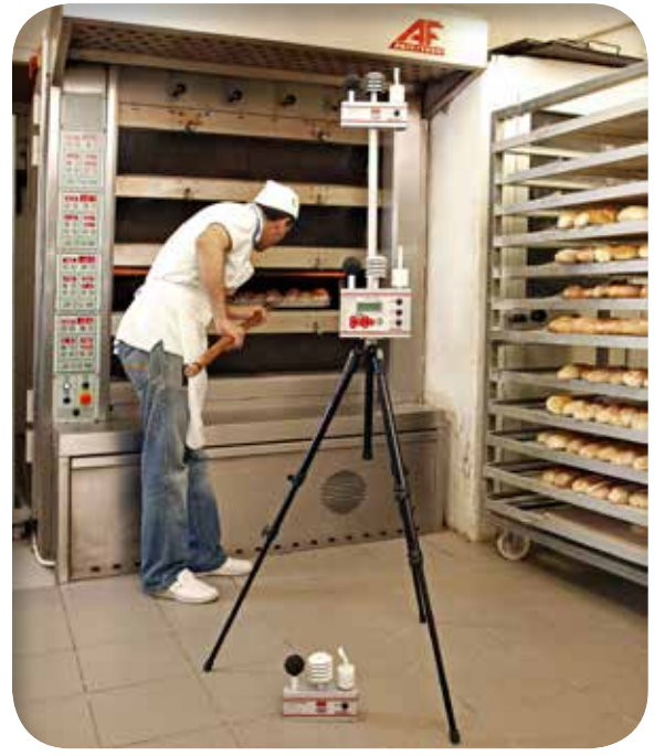
Three levels WBGT on the same vertical