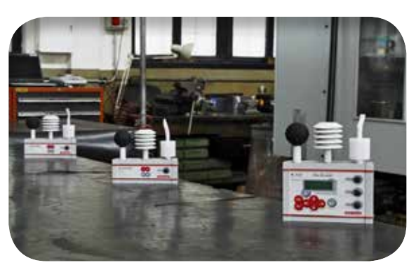
WBGT in three positions of the same environment