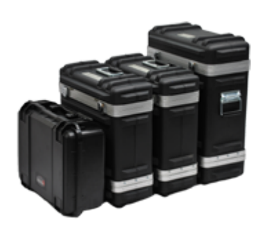
MINI, iTIG II, 30kV Power Pack II & 40kV Power Pack II