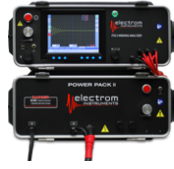
iTIG II & 30kV Power Pack II