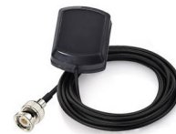
Standard GPS antenna supplied with 5 meters of cable