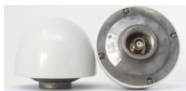
High Gain GPS antenna

The High Gain GPS Antenna is designed for stationary application, all weather and harsh environment to provide a strong signal. This antenna is also a high-quality solution for adding GPS RF signals to marine GPS navigation systems. The high gain GPS antenna can be setup with up to 70 meters of cable. The high gain GPS antenna is supplied with stainless steel antenna mount.