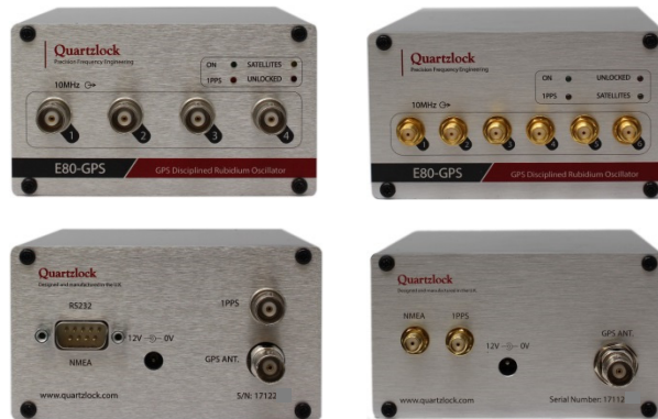
Examples of front and rear panel configuration.

The E80-GPS can be configured to frequencies 1 to 100MHz of your preferred signal format. Standard connectors are BNC and SMA, other connectors are available.