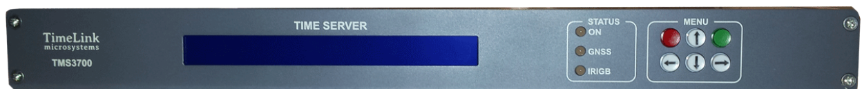
TMS3700 front face of the equipment

This approach allows a fast and safe reconfiguration in case of replacement of the unit.