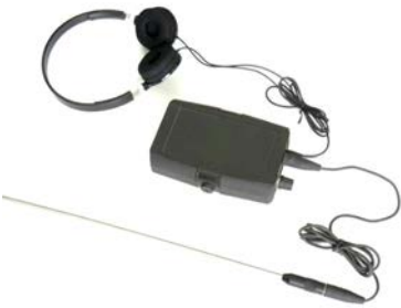
Audio Probe KIT