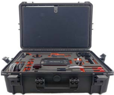
LDN Stealth Complete Delivery Set