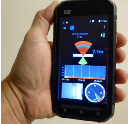
Android APP Interface