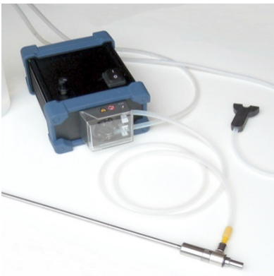
Slow Water Pump & core drill bit system