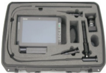
Full Surveillance KIT